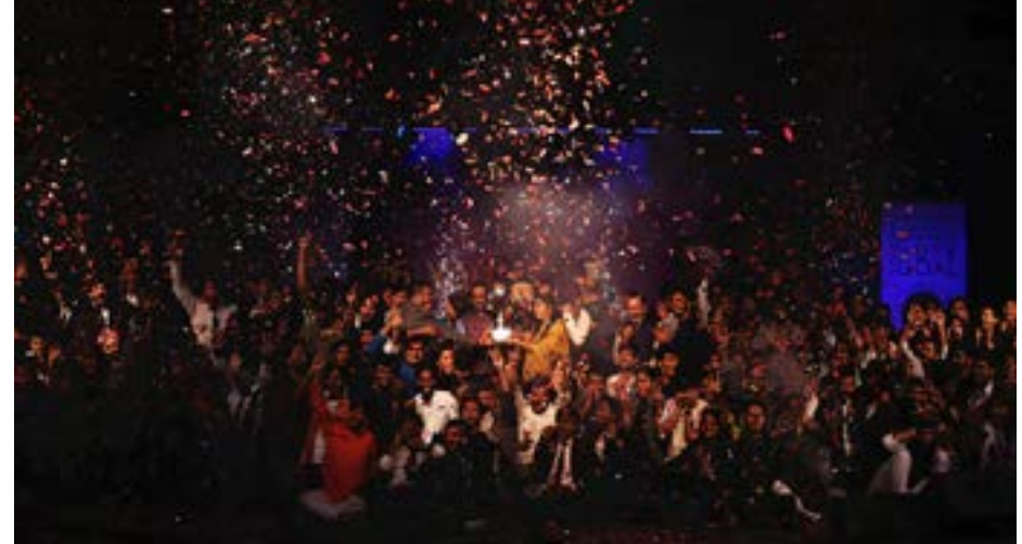
The various events enticed the audience leaving them spell bound by the creative minds of different schools. It set an example of Diversity in Unity.