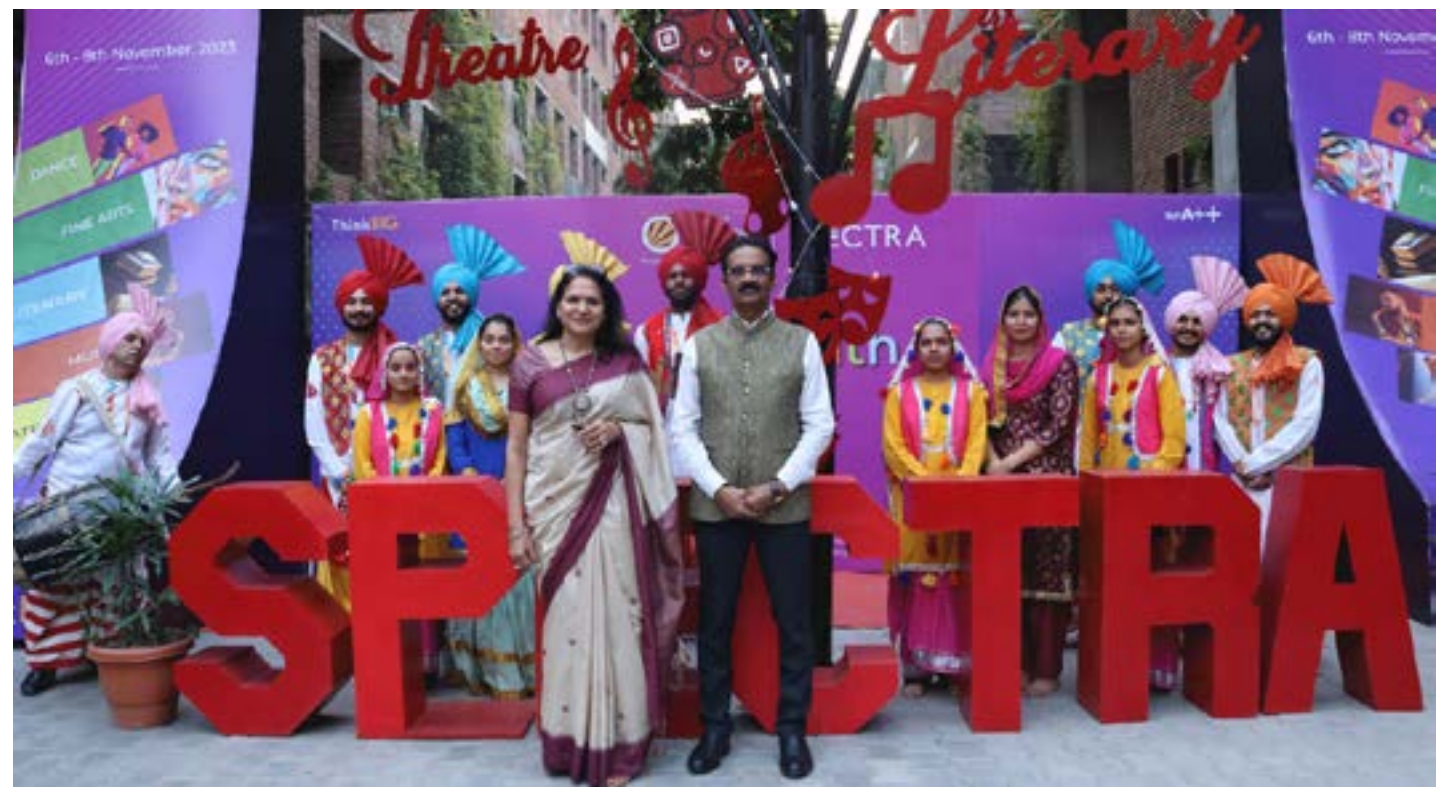
The Division of Arts & Culture at the Student Welfare Wing of LPU organized its Three-Day Annual 16th Inter School Youth Festival 'Spectra 2023' with the theme "Trans-Inclusive Society" . For this, 4000+ students participated in theme related 40 competitions held in the genres of 'Dance, Music, Literary, Fine Arts, and, Theatre & Social Media'.

SPECTRA'23- An Inter School Youth Festival with the theme "Trans-Inclusive Society" started with full enthusiasm.