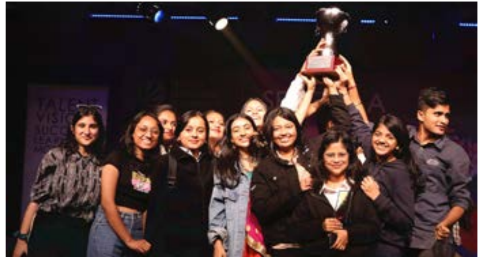
At the closing ceremony of SPECTRA 2023 Inter School Fest everyone went nostalgic as almost 4000 novices worked day and night to make it a success along with the backend team. The arduous work of the team had set the scale high for next SPEC-TRA team. We all wish everyone good luck.