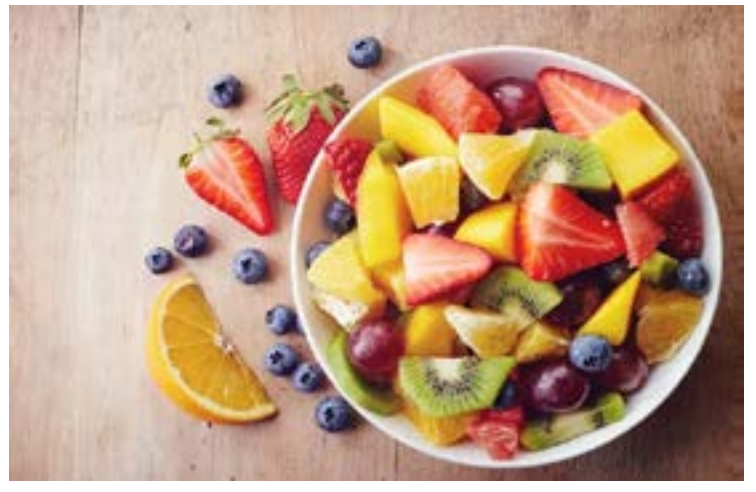
This speedy salad is a breeze to put together, needs no time on the stove, and delivers a nutritious and fulfilling meal. Feel at liberty to personalize your salad with extra ingredients or toppings to suit your palate.

Place all the chopped fruits in a mixing bowl. You can add fruits such as apple, papaya, banana, mango, muskmelon, dragon fruit, blueberries, and kiwi. Next, add salt, lemon juice, pepper powder, and trail mix to these fruits. Toss the mix a couple of times so that everything gets mixed properly. Serve immediately as a delectable midday snack