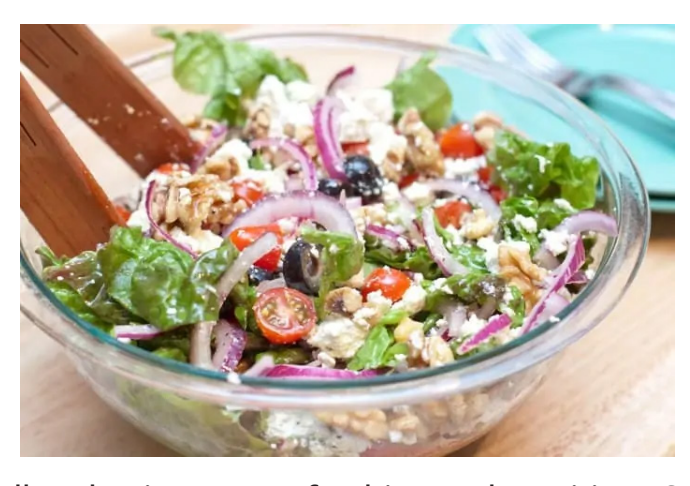
5. Mix well and enjoy your refreshing and nutritious Salad.

This salad is quick to assemble, requires no cooking, and provides a healthy and satisfying meal. Feel free to customize the salad with additional ingredients or toppings as per your taste.