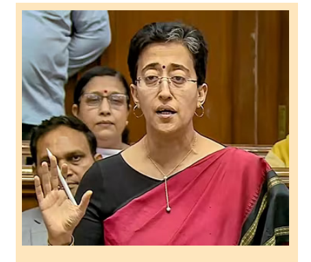
Delhi Budget 2024: AAP Government Allocates ₹16,396 Crore for Education

The Delhi government has allocated a substantial amount of ₹16,396 crore for education in the upcoming financial year. This significant investment highlights the government's commitment to enhancing the educational sector and providing quality education to the residents of Delhi.