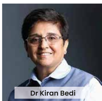
Dr Kiran Bedi

Dr Kiran Bedi is the first woman IPS of India. She is also known for her services as Inspector General (IG) in Tihar Jail, where she introduced various reforms, for which she received the "Ramon Magsaysay Award".