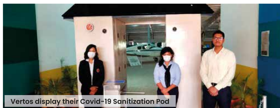
Vertos display their Covid-19 Sanitization Pod

Keeping people's safety in mind especially during Covid-19 times, researchers at LPU came up with a unique 'Covid-19 Sanitization Pod', which can help in preventing the spread of the virus.