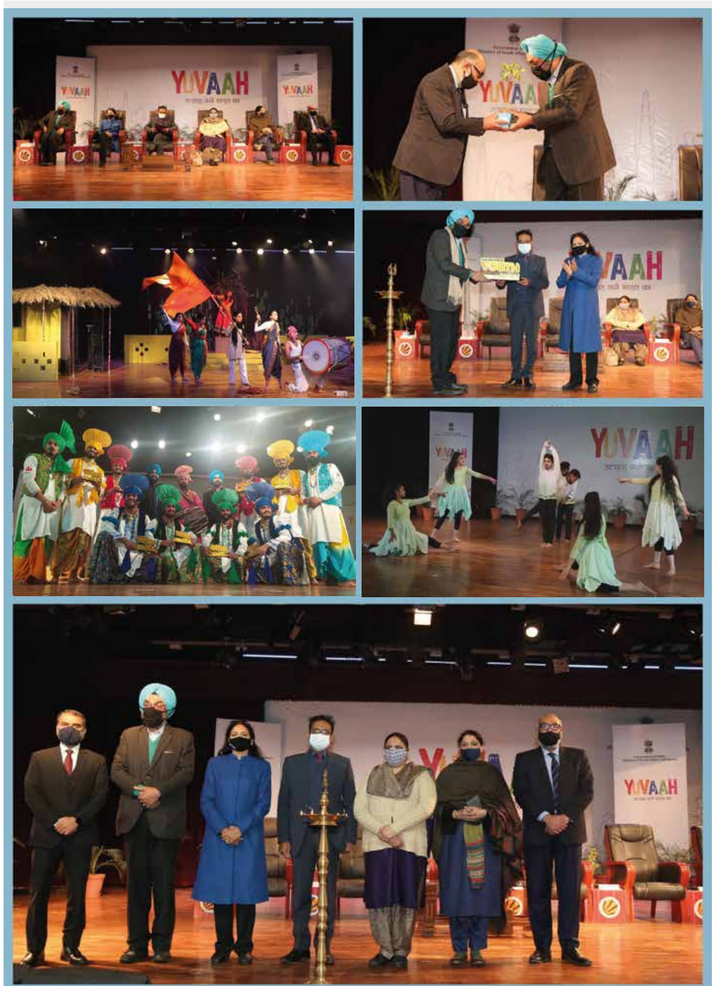
Hon'ble Chancellor - LPU, Pro-chancellor - LPU & other luminaries during inauguration of Punjab State Youth Festival

Altogether 24 events were organized under 8 different categories - Music, Dance, Theatre, Regional Attire/Poshak, Visual Arts, Expression Arts, Knowledge sessions & Indigenous games. All these competitions took place from 2nd to 4th January 2021 in different venues of