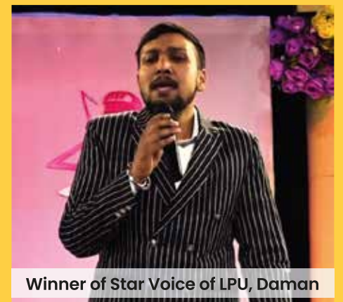
Winner of Star Voice of LPU, Daman

Apart from the participants, the show was judged by eminent singers of the industry. First and foremost of all the